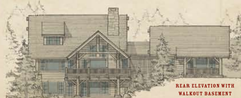
REAR ELEVATION WITH WALKOUT BASEMENT