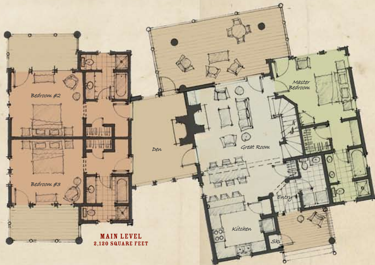
MAIN LEVEL 2,120 SQUARE FEET