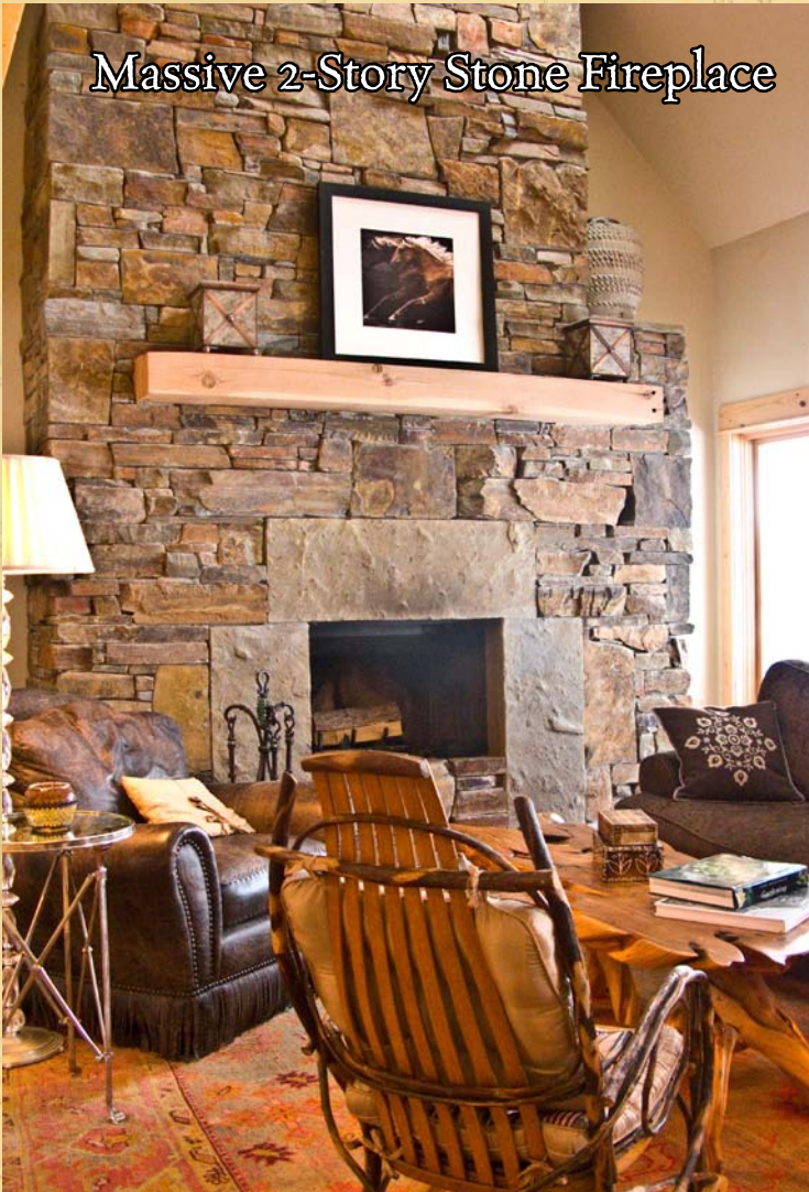
Massive 2-Story Stone Fireplace