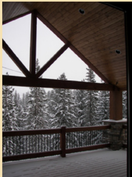
Large covered deck with Yellow Mountain views.