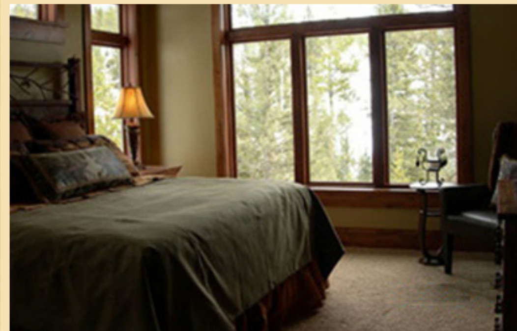
Master Bedroom on main level. Custom home in secluded setting.