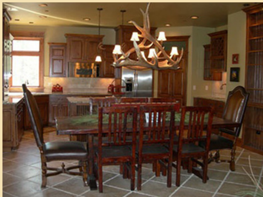
Gourmet Kitchen and Dining Area.