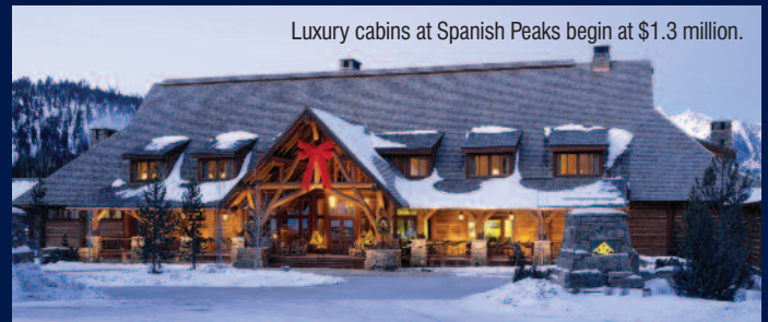
Luxury cabins at Spanish Peaks begin at $1.3 million.

Although the market isn't as strong as it used to be, the allure of Pronghorn hasn't faded. "The days of the speculators have gone," Hix says. "We're seeing a buyer who wants to be part of the community."