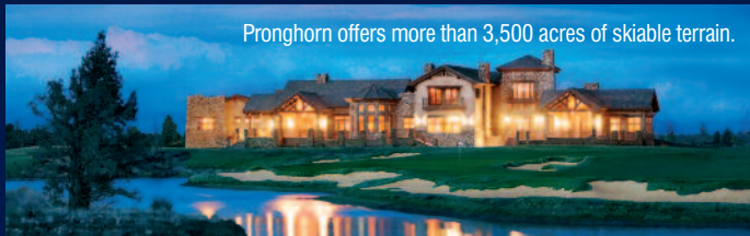
Pronghorn offers more than 3,500 acres of skiable terrain.

Today, Pronghorn offers a variety of residences, from 15,000-square-foot plots to million-dollar estates. Hix has also opened the resort to the "stay and play" crowd, which offers a taste of a luxury membership at Pronghorn.